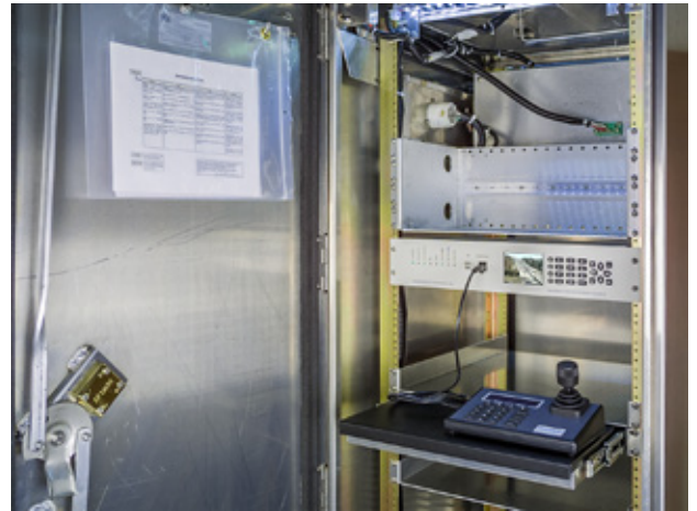
ITS Cabinet PN 36H24W20DITS