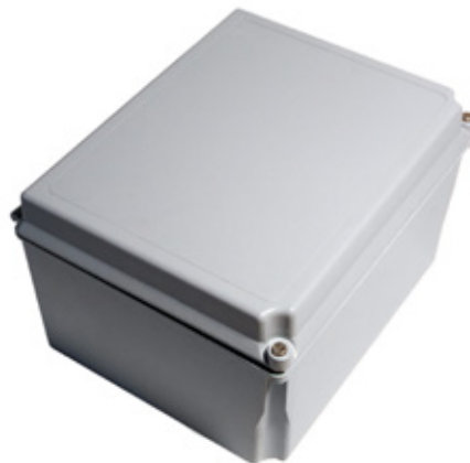
NEMA4X Enclosure 10" x 8" x 6" - PN 342395 14" x 12" x 8" - PN 342608